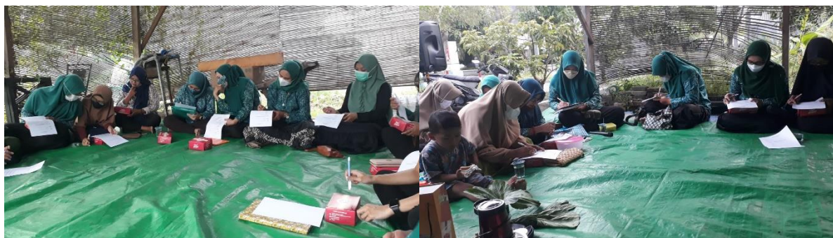
Figures 1. Questionnaire filling documentation

Community service activities are carried out during the monthly routine PKK activities in Jakarta in Bligo village, RT 21, RW 08, Candi District, Sidoarjo Regency on Sunday, June 26, 2022. The number of PKK women is 30 people. However, when this service activity was carried out the number of PKK women who attended was only 27 people. Through this initial community service activity, 27 PKK women who attended were filled in questionnaires.