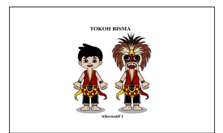
Figure 2. Alternative 1