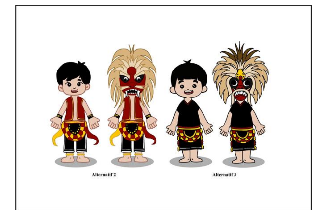
Figure 3. Alternative 2 & 3