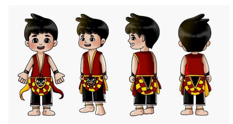
Figure 5. Bisma final character