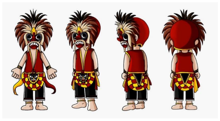
Figure 4. Bisma final character