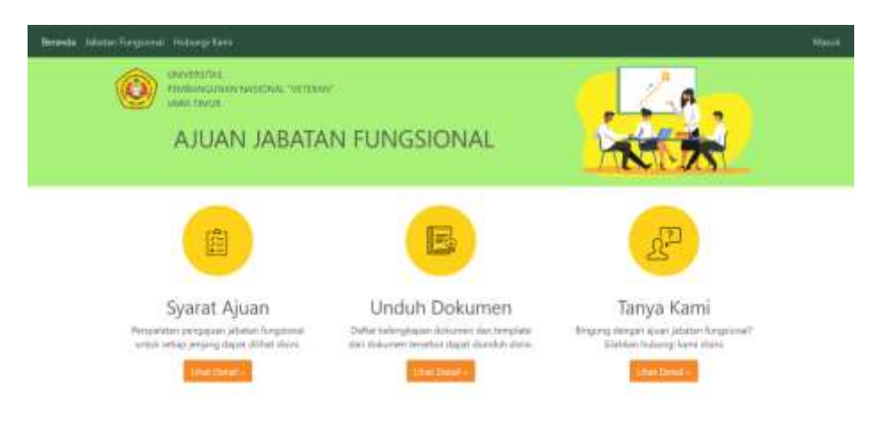
Figure 4. UPN functional position submission website interface

The digital communication model, which was later proposed by the research team, in this case, is intended as a means of socialization as well as an effective and efficient public hearing. The digital communication model is intended to be developed in a website display that contains policy dissemination, especially the SOP for the submission of functional positions of lecturers, which also contains comments and criticism columns, questions and answers for lecturers as a means of open socialization and public hearing. This digital communication model is not intended to close direct communication opportunities with holders or authorities. The goal is to facilitate communication through digital means in the era of information technology development. The process of creating a website refers to the needs of the lecturer. There are steps, download templates, requirements for submitting functional positions, and discussion pages of the website. Figure 4 is the website view page. Hierarchy is made following the interests of the functional position of lecturers, especially for assistant experts and lecturers.