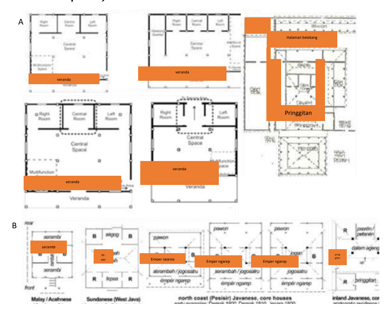
Figure 3. A. Different Javanese Vernacular Houses from the simple one (common people) to more elaborated or complex house. B. the variation of simple vernacular houses from Malay to coast and Inland Javanese houses.