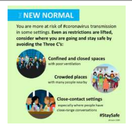
Figure 1. WHO new normal regulation