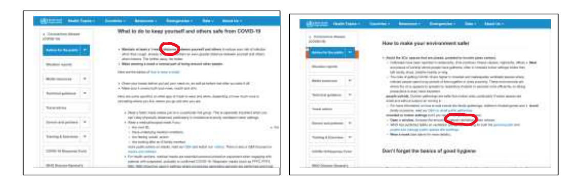
Figure 2. WHO guidelines: advice for public

There are still more guidelines from the WHO, but only these two that concern this paper. The focus of this paper will be on spatial distancing than the active cooling system because this paper will talk about the spatial arrangement. This is what makes me wonder if keeping the distance will change the spatial arrangement in the building. Could this space distance better the chance for keeping the safety of the occupants? We will try to find the answer from the spatial arrangement that happened in the past so that we can derive some knowledge.