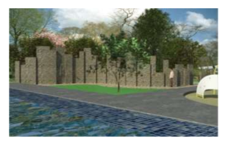
Figure 4. Use of local natural stone materials, in the shower area and shower