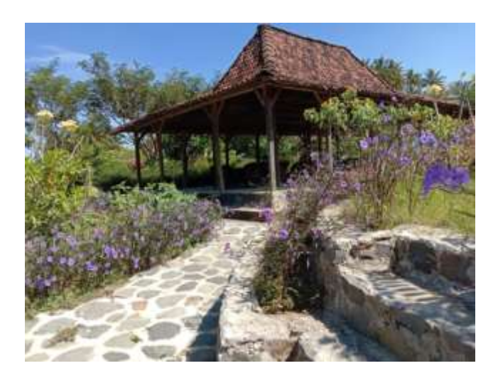
Figure 2. The use of the ponorogo vernacular architectural style in the Bale / Pendopo building

In the existing (existing) Bale/Pendopo building in the Sanggraloka Sekar Wilis area, it uses the Limasan-Sinom type arap form (Susilo, 2018), with a rectangular building typology, and the building is open, without any walls covering the space. So that the roof of the building functions as a shade, and from inside the building can view the broadest natural panorama in all directions.