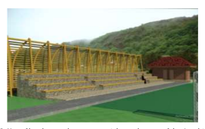
Figure 3. Use of local natural stone materials, on the seat of the Amphitheater

It is hoped that using this local material will contain economic value and efficiency, as well as ease of work for the local community. Also, the expected final result of the building's appearance with the use of vernacular architecture supported by local materials will create harmony with the appearance of the building with the surrounding environment. The following pictures are ideas for building designs, in the Amphitheatre seating area and Shower and Rinse Place, using local natural stone materials, which are widely found in the area. Here's a visual picture: