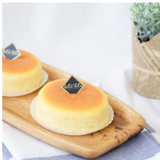
Figure 1. Japanese Cheesecakes product by “Bite and Bite cakes”

In addition, this factory also accepts orders for birthday cakes, boba cakes, brownies, crazy bananas, cinnamon rolls, and many more.