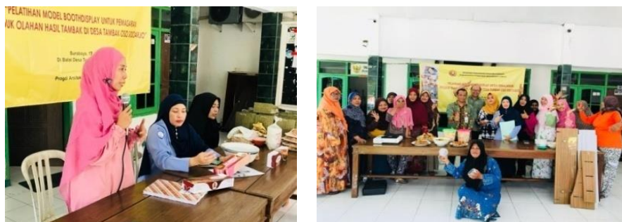
Figure 2. Participants in counseling and training in the design of display booth for fish processing products from Tambak Oso Sidoarjo Village

participants were given questionnaires / content forms related to their respective products as data for the improvement of the display booth design