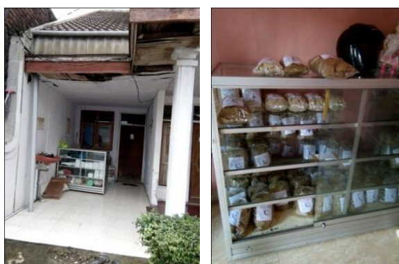
Figure 1. Display booth of existing milkfish and cracker products