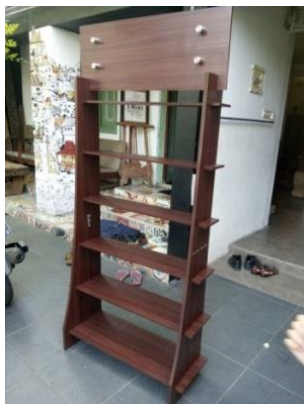
Figure 7. Locking section at the top

The locking part is the final part that is installed on the display booth. Besides functioning as a locker it also functions as an logo display because it is equipped with an acrylic board to display the company name / logo / UKM.