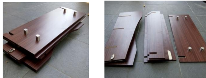
Figure 4. 3 Main parts of the display booth

The processed display booth of the pond consists of 3 main parts, namely the column section, the rack part and the locking part. This is so that the concepts of easy and efficient can be achieved. The resulting display booth can be easily assembled and easy to mobilize (picture)