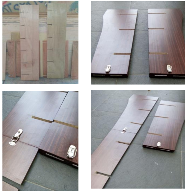
Figure 5. column section

The column section is the part that supports the whole other part. This section is a structural part so that the rack can stand firm. The height of the section of this column is 140 cm. Because it uses the concept of easy and efficient, a folding system is made to be easily carried when you want to use. The folding process is by dividing the length of the column into two parts then for the unification process using hinges and hooks.