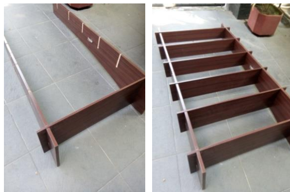
Figure 6. Rack section

On the shelf there are six shelves as fillers. The function of the shelf here is as a place for displaying processed fish products. The shelf width adjusts the type of product produced. The maximum width of the product is 30 cm, so the width of the shelf also adjusts. This is intended to be easy to understand and does not take up a lot of space. The joint that is used is a cross link between the rack and the column.